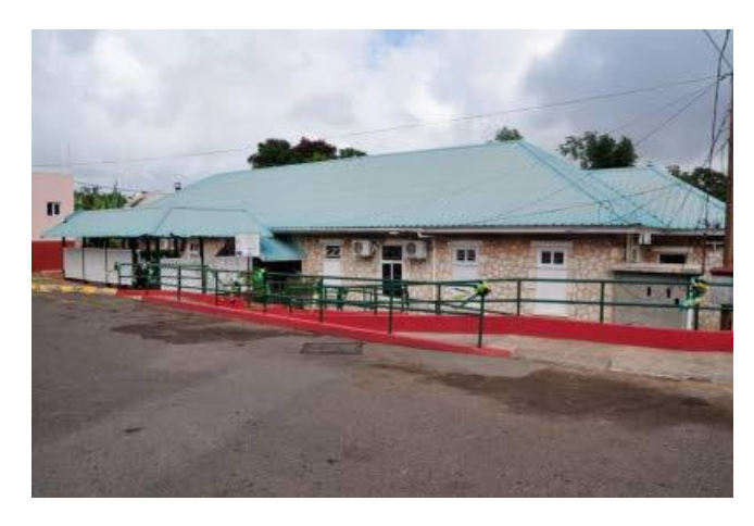
New Eye Clinic - Mandeville Regional Hospital

Former Health Minister Hon Horace Dailey officially opened the State of the Art Ophthalmology Clinic/Theatre facility on January 28th, 2016. The new facility was funded at a cost of more than $80 million primarily from the European Union.