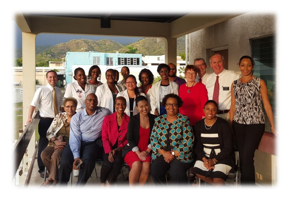
UHWI-KPH- Church of Latter Day saints outside the Eye Clinic UHWI

http://www.loopjamaica.com/content/video-uhwi-gets-10-million-donation-help-eye-disease-fight