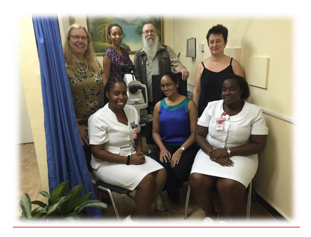
VISION 2020 LINKS - Moorfield-Homerton- UHWI DRS team